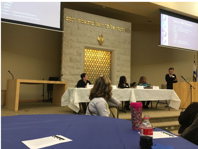
Panel at Soul to Soul Gathering