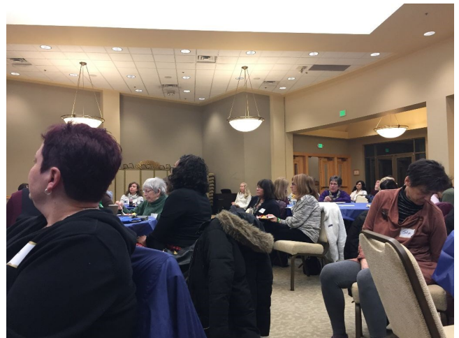
Participants at Soul to Soul Gathering